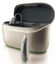
Phonak ChargerGo RIC Infinio with built-in battery for charging on the go