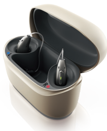
Phonak Charger RIC Infinio for cable charging