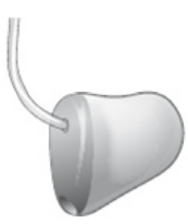
Fig.1 cShell - standard tube

We offer an alternative cShell build style with an anterior tube outlet. This build style provides high cosmetic acceptance in spite of a slightly larger size and can be used in case of build problems due to anatomical limitations. This build style is available for acrylic shells only.