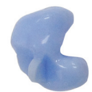
Light Blue (34)